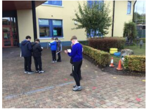
Classes went on Maths Trails in the school grounds during Maths Week